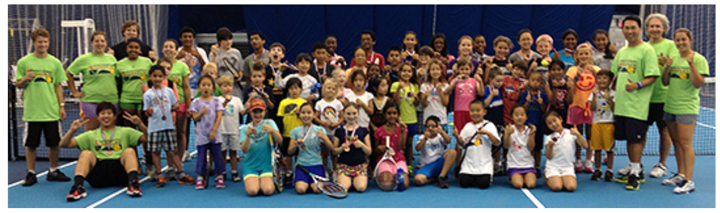
Campers gather for a "team photo" at one of the Summer Camps held at th Plex.

facility serves all ages: children, adults, and seniors, and it is one of the largest and fastest growing programs in the United States."