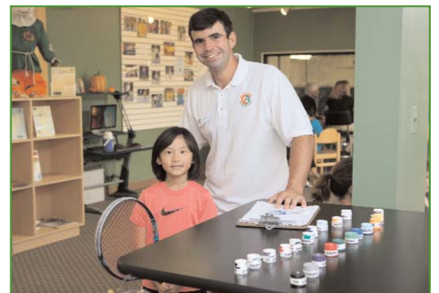
Green Spring Racquet Club Adds New GRIPS Program