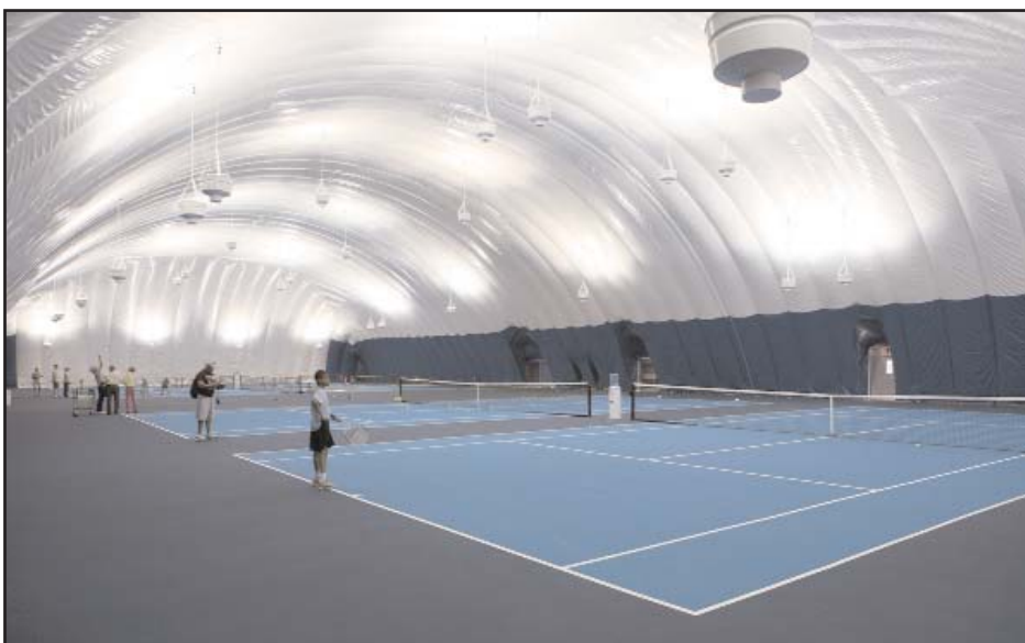
When one enters the indoor courts you are immediately taken by how bright they are.