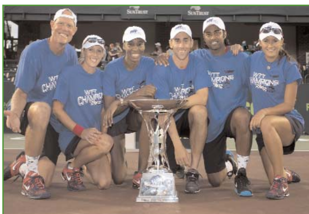
Kastles Win Third Title in Four Years