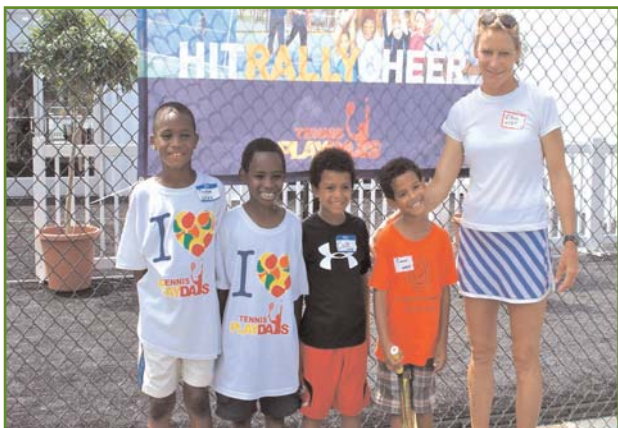
New WTEF Youth Tennis Program Harnesses Technology